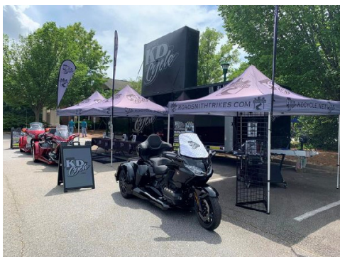
KD Cycles are making their rounds to the Rallies. Be sure to check them out.